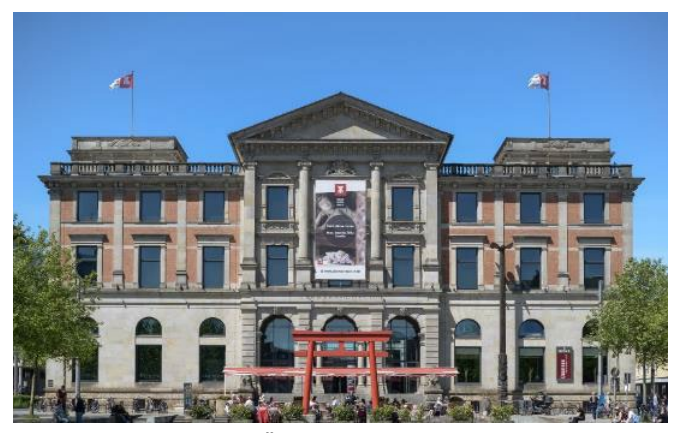
Exterior view of the Übersee-Museums

The Bremen Cotton Exchange and the Bremen Fibre Institute are inviting to the well-known and popular Bremen Cotton Night again this year again. It is characterised by the 150<sup>th</sup> anniversary of the Bremen Cotton Exchange and is for good reasons taking place in the Übersee-Museum (Overseas Museum) Bremen this time: concurrently that evening, the